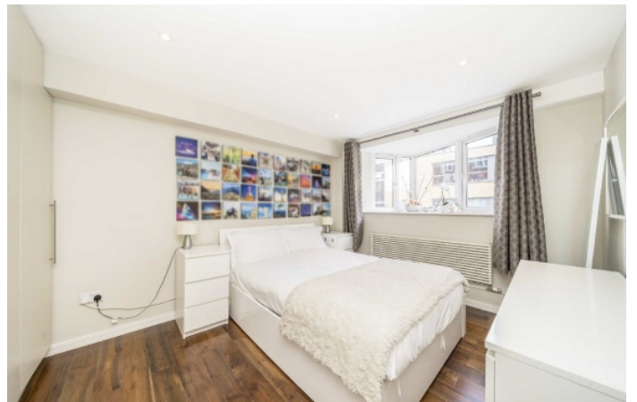
Long Lane, SE1