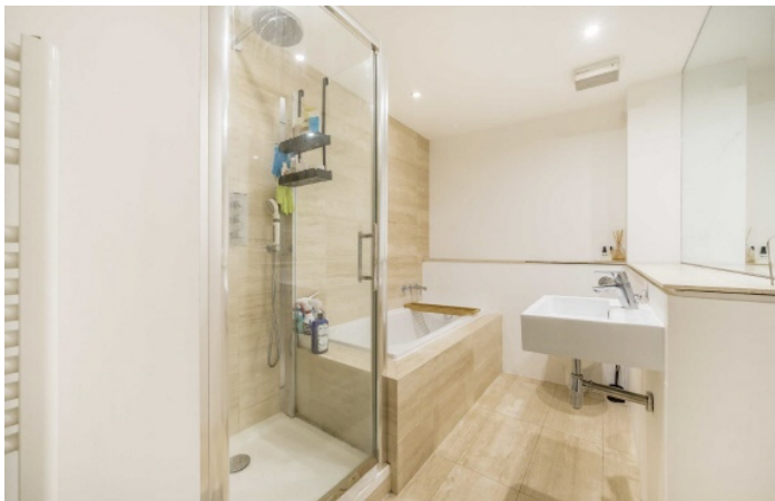
Long Lane, SE1