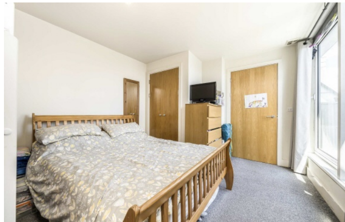
Empire Square South, SE1