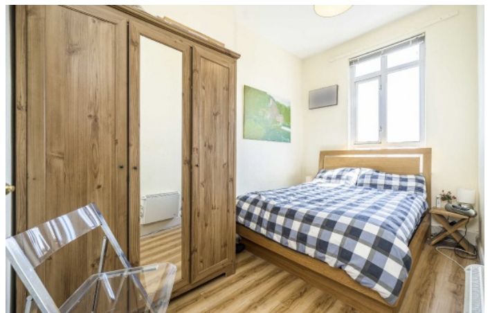
Bath Terrace, SE1