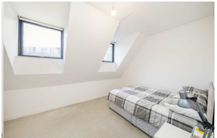
Blackfriars Road, SE1