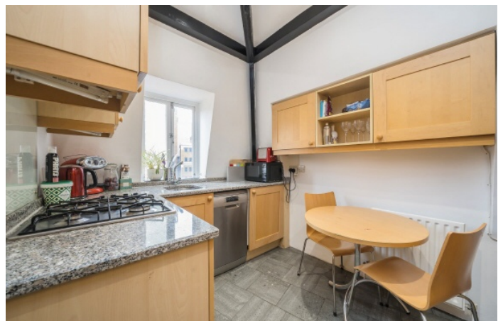
Weston Street, SE1