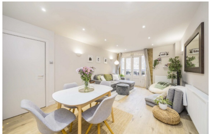
Magdalen Street, SE1