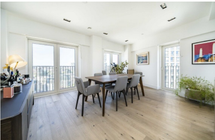
Exchange Gardens, SW8