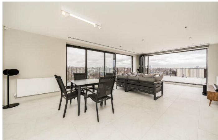
Kilburn High Road, NW6