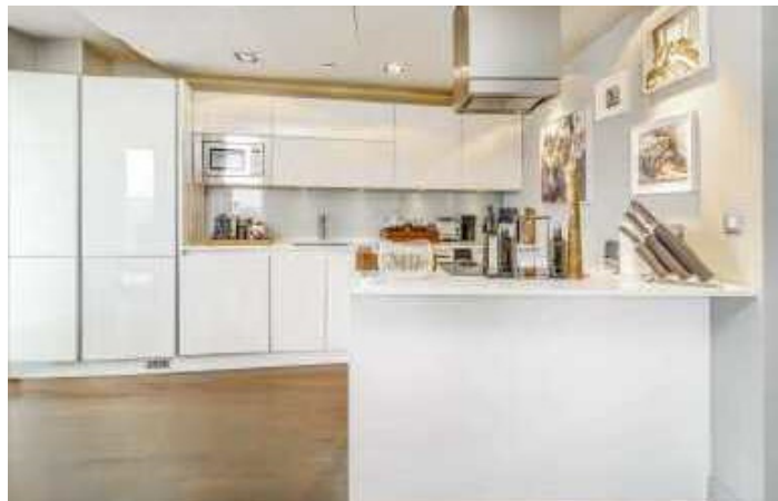
Avantgarde Place, E1