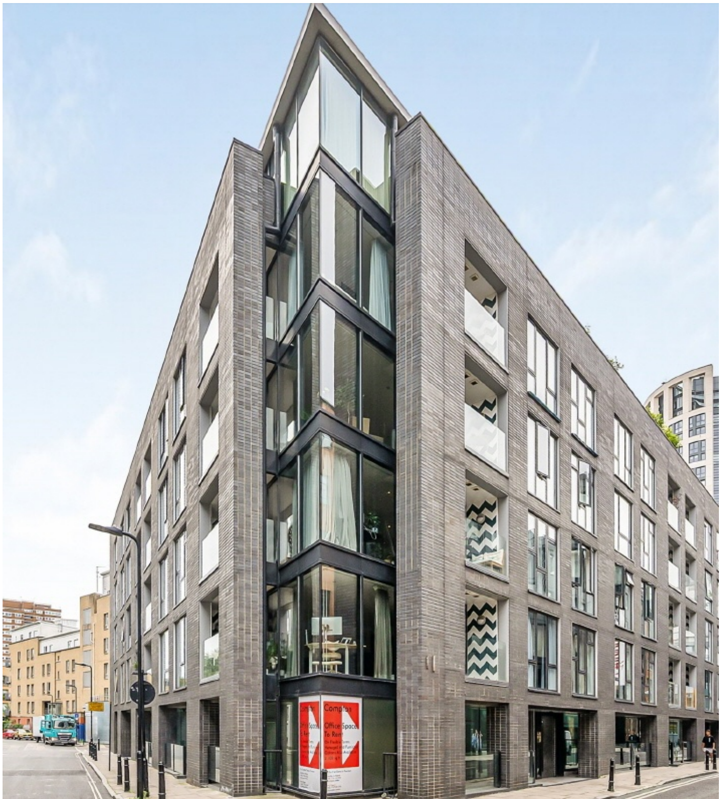
Westland Place, N1 £850,000