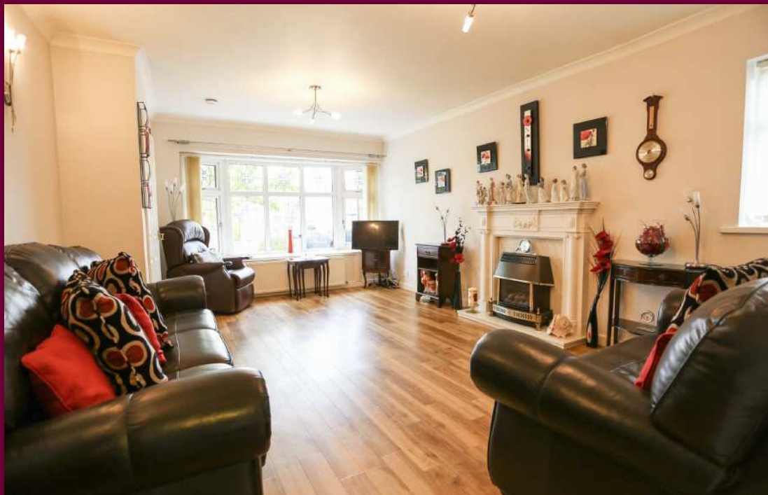
2 Flint Close Hazel Grove Guide price £409,950