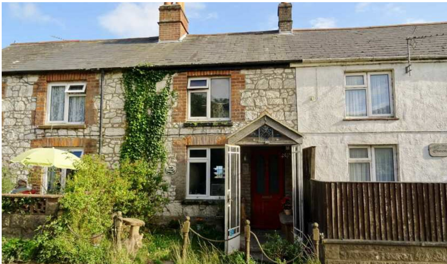
5 Brookfield Cottages, Upper Road, Adgestone, Isle of £225,000