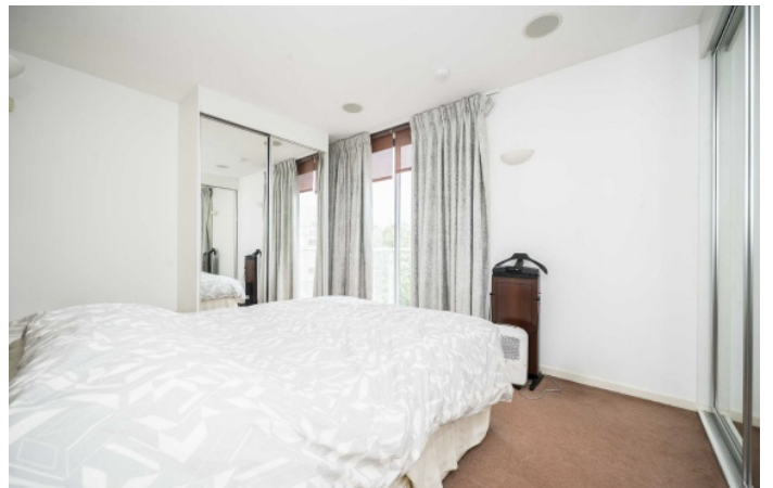
Monza Street, E1W