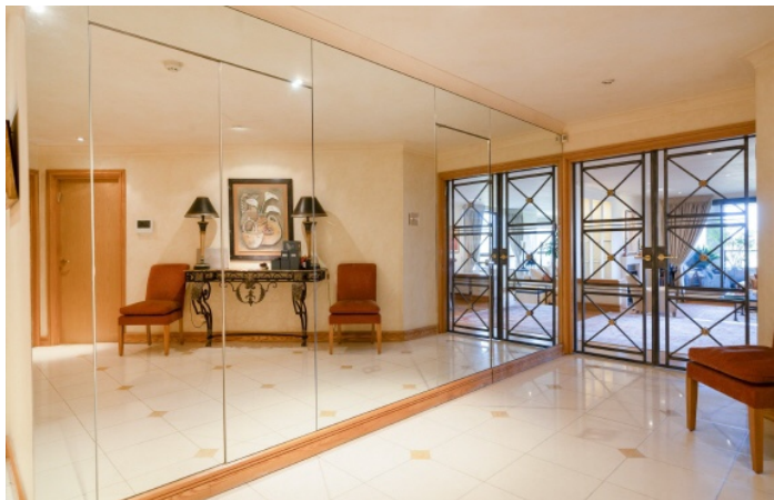
Lower Terrace, NW3