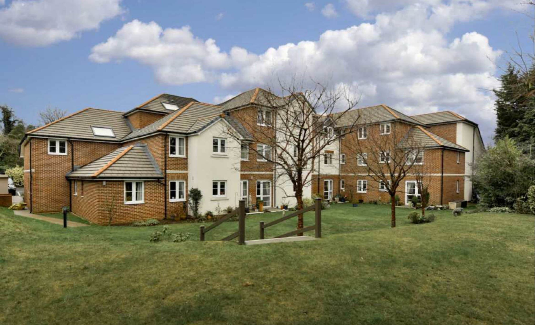
Park Hill Road, Epsom