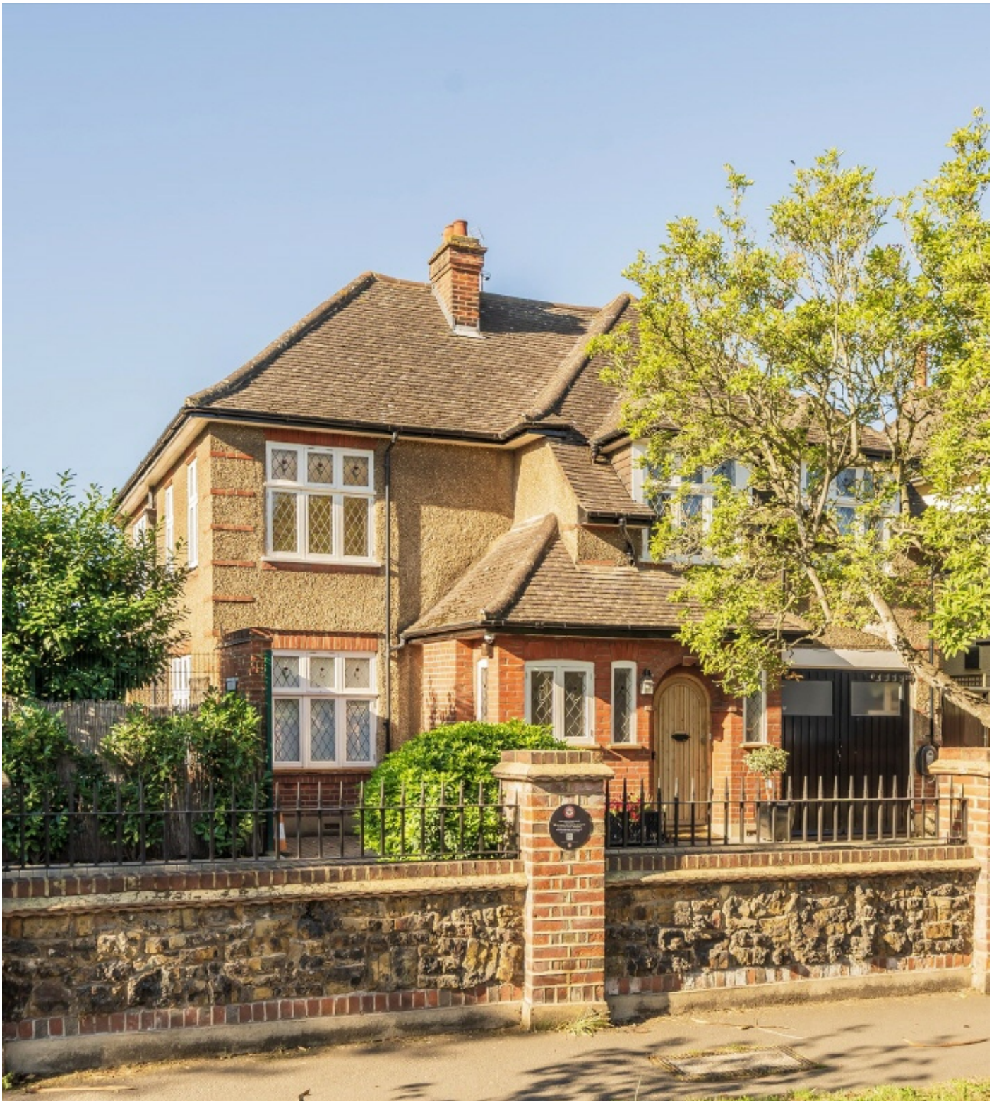
Boston Gardens, TW8 £2,475,000