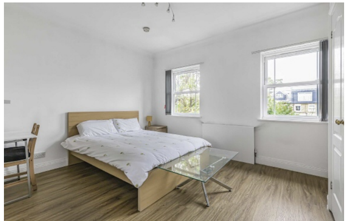
Clarence Mews, SE16