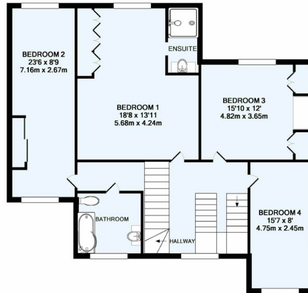
1ST FLOOR APPROX. FLOOR AREA 981 SQ.FT. (91.1 SQ.M.)