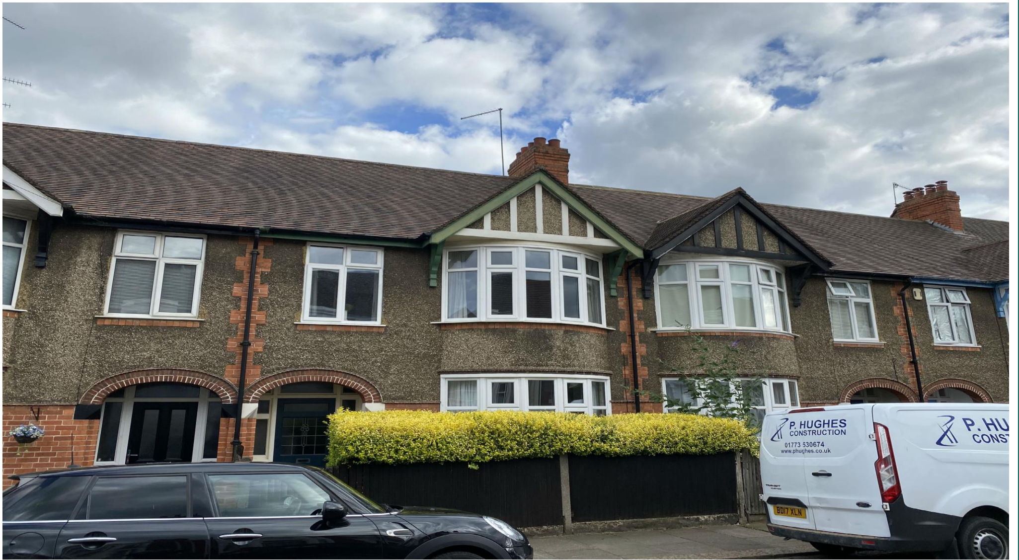
Balmoral Road Queens Park, Northampton