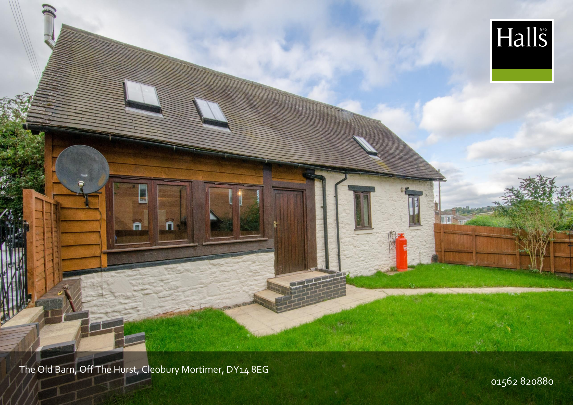
The Old Barn, Off The Hurst, Cleobury Mortimer, DY14 8EG