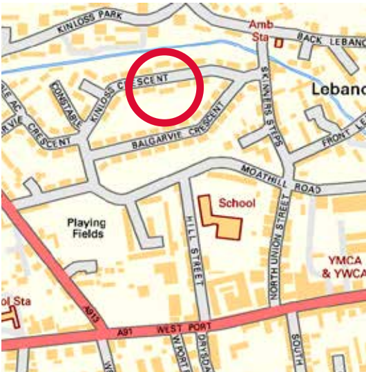
Contains Ordnance Survey data © Crown copyright and database 2016