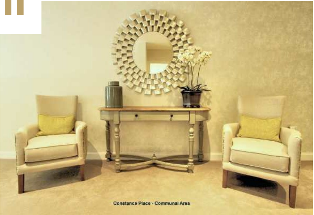
Constance Place - Communal Area