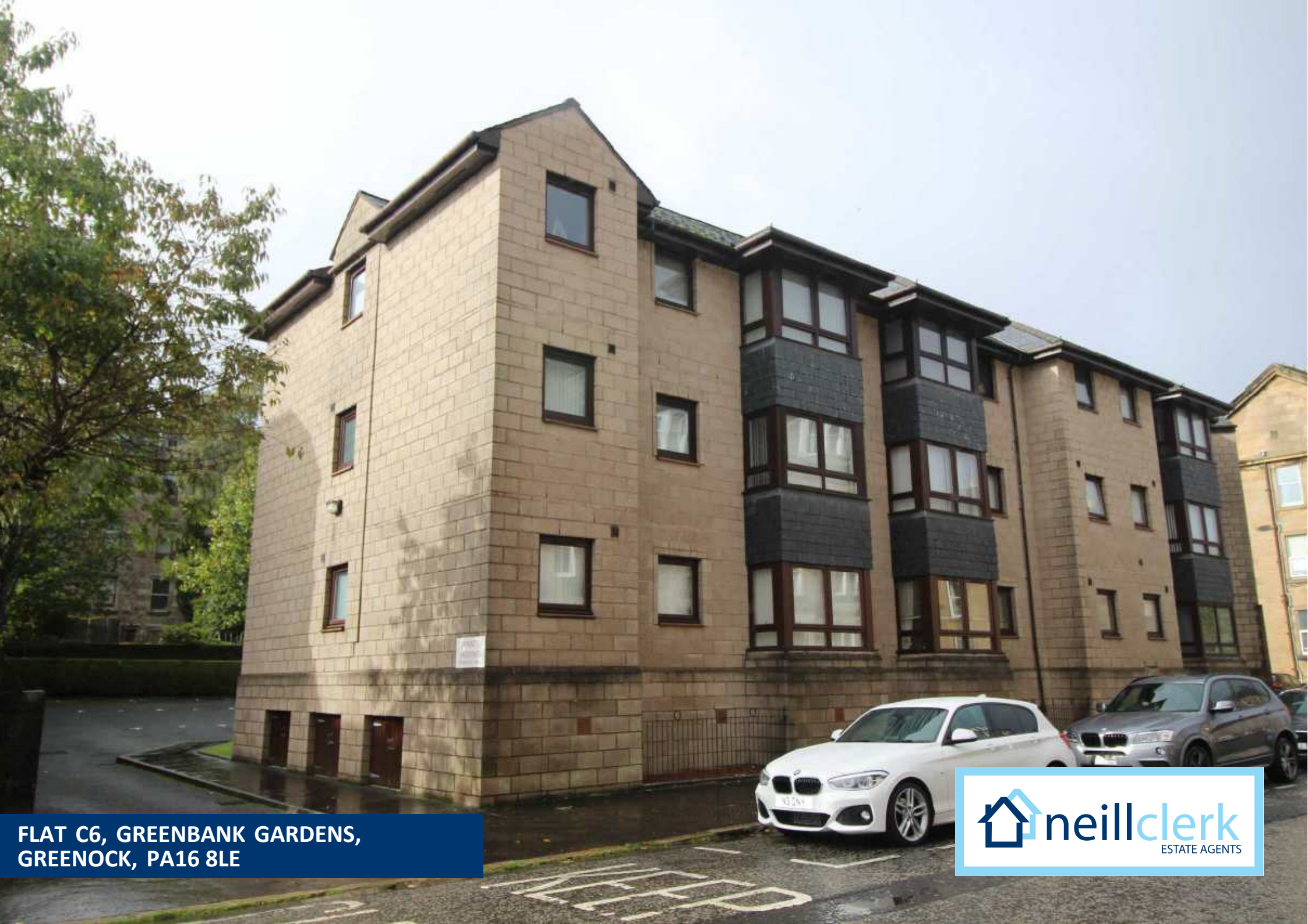
FLAT C6, GREENBANK GARDENS, GREENOCK, PA16 8LE