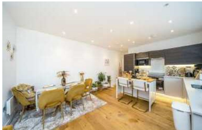
Nobel Drive, UB3