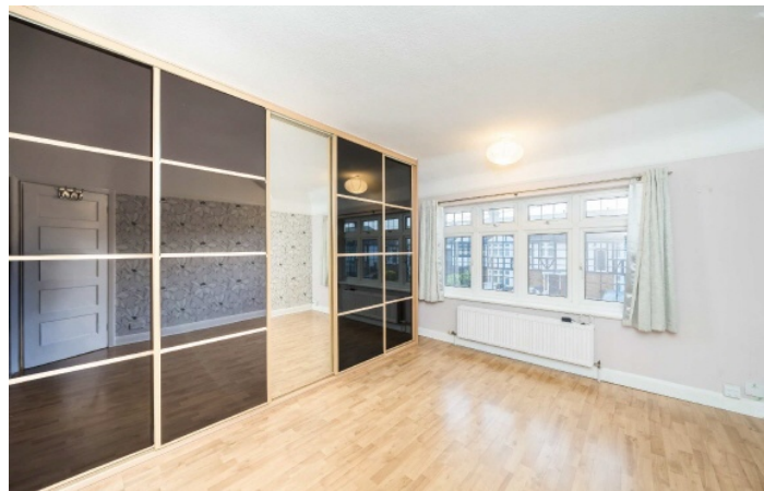
Wolsey Drive, KT2