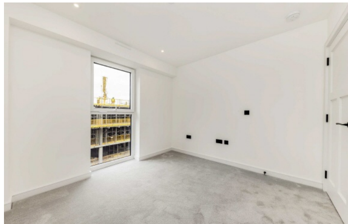
Brook Street, KT1