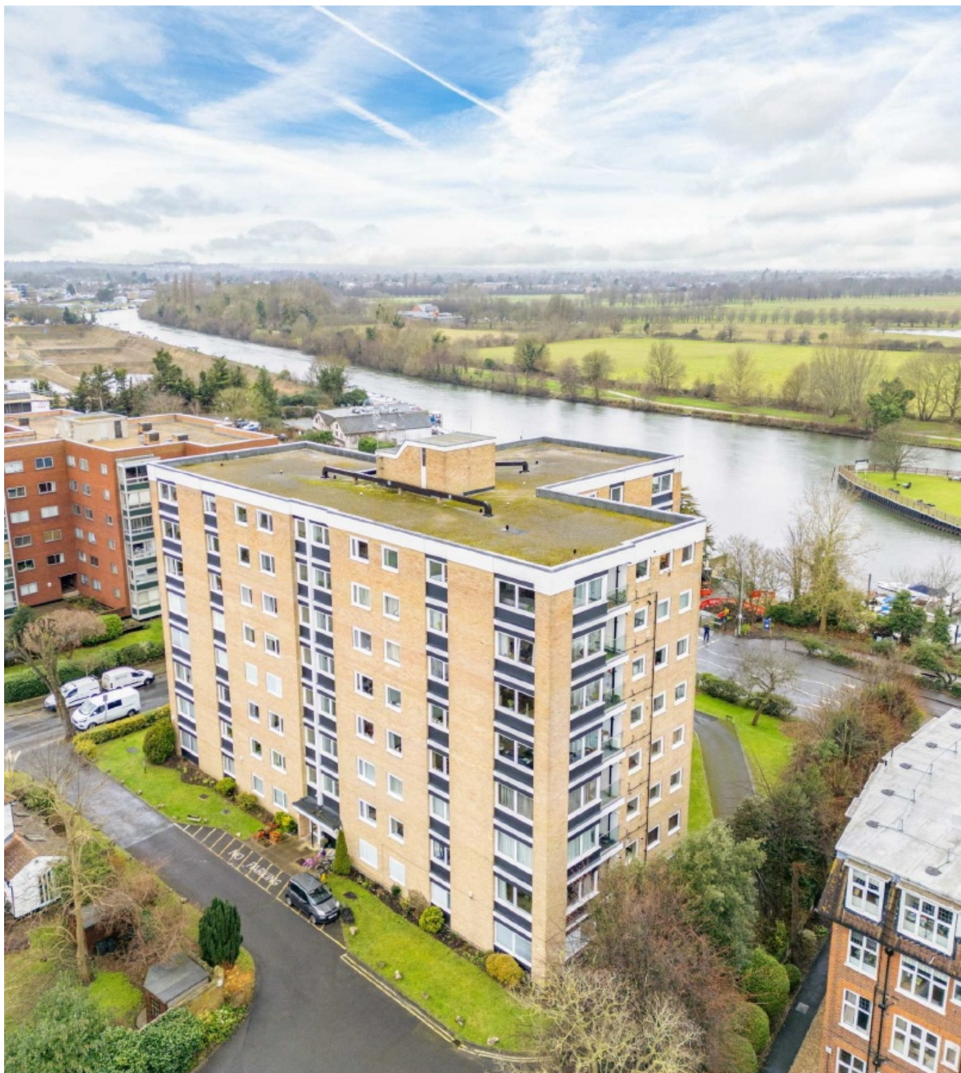
Anglers Reach, KT6 £660,000