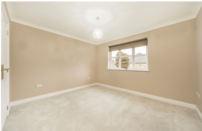
St. Andrews Close, KT7