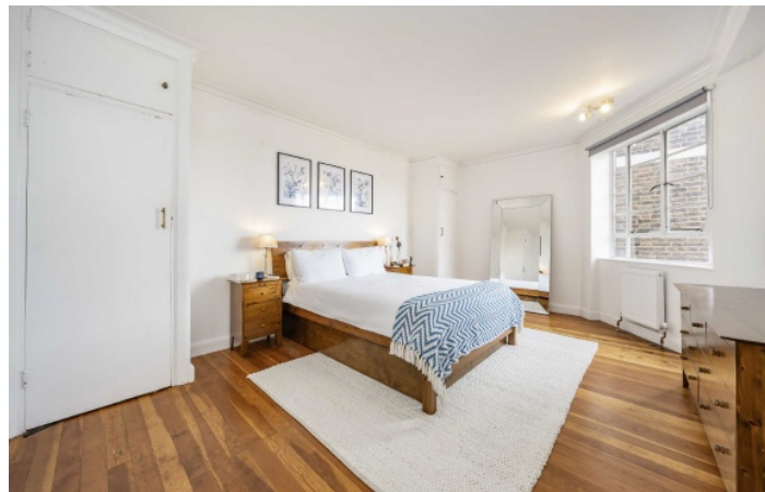
Nightingale Lane, SW12