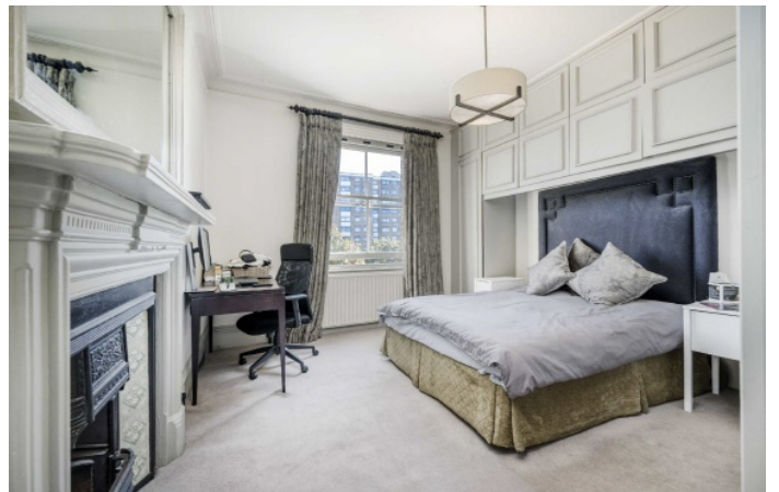
Beaumont Crescent, W14