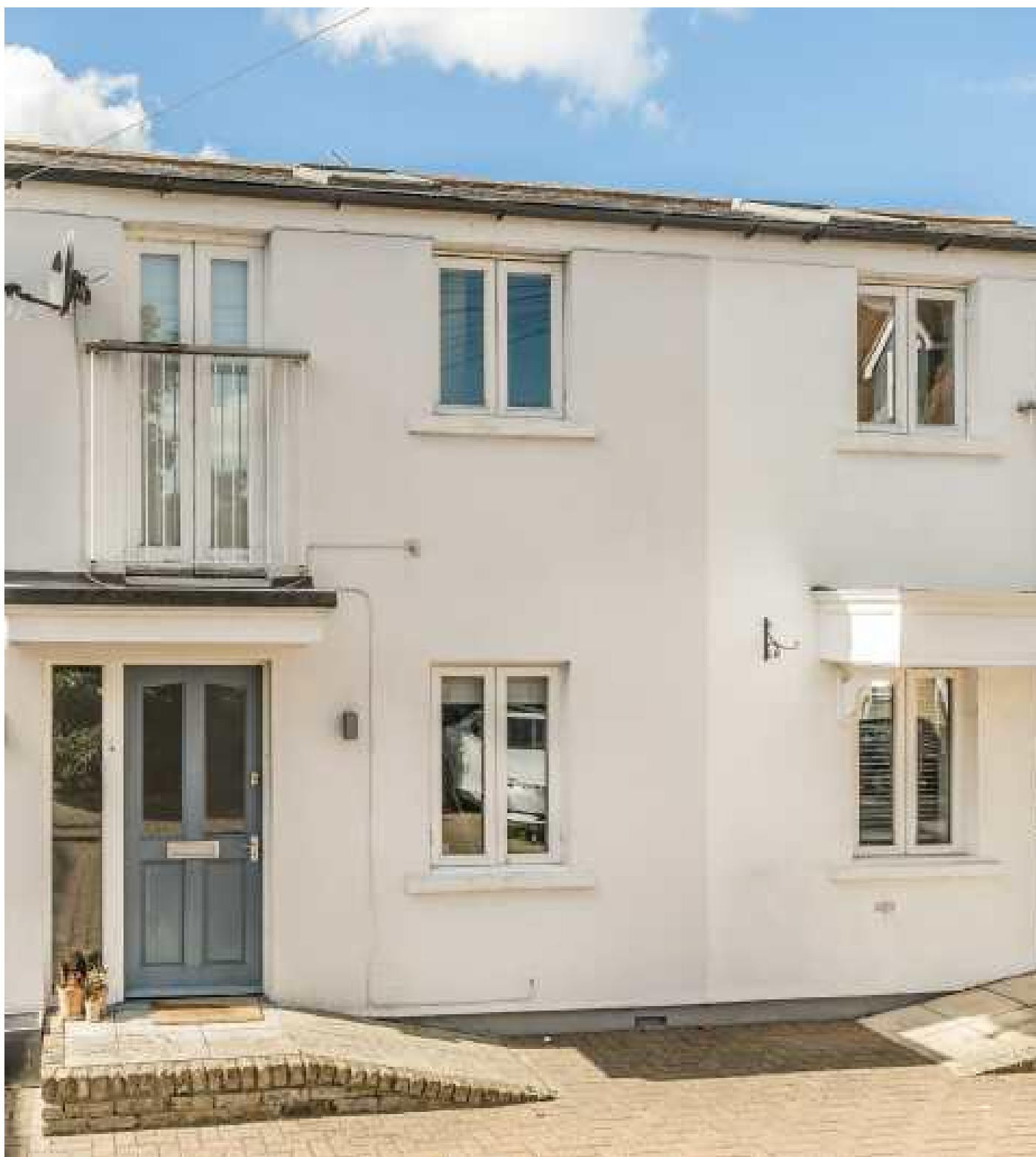
Trinder Mews, TW11 £375,000