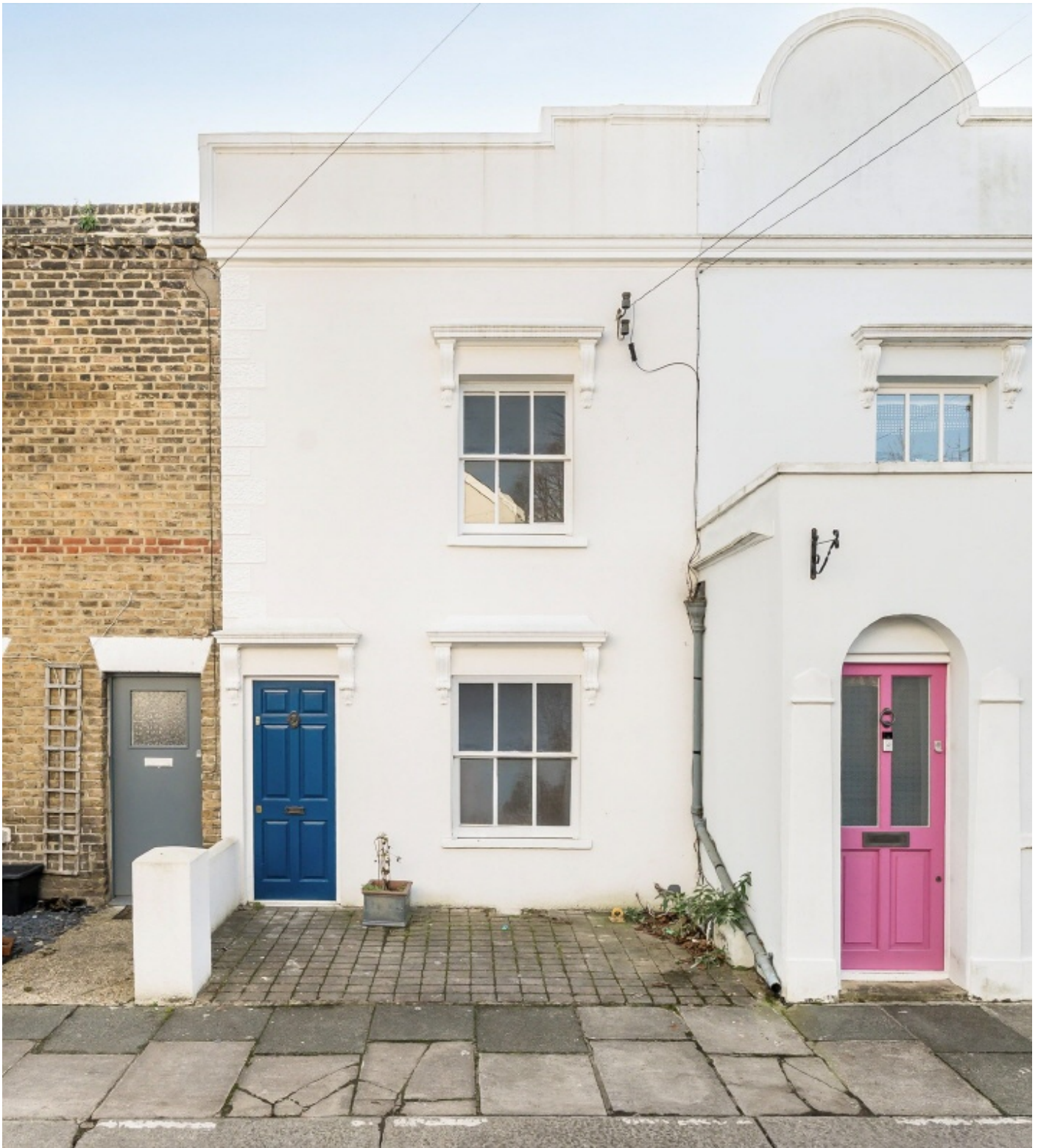
School House Lane, TW11 £749,950