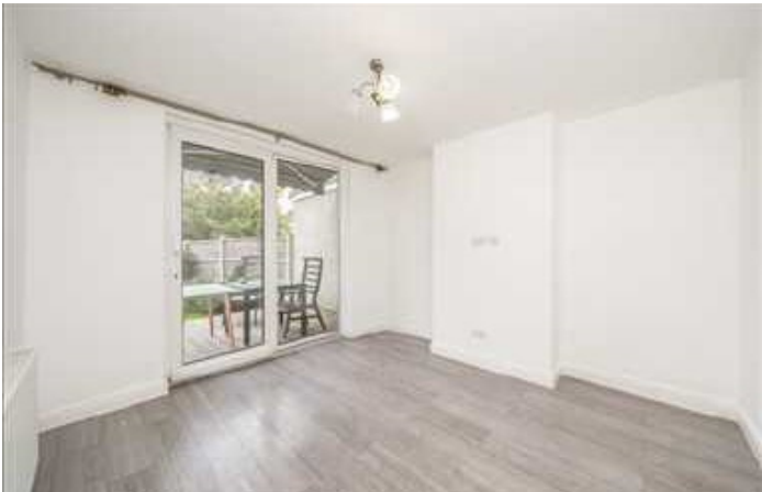
Layton Road, TW3