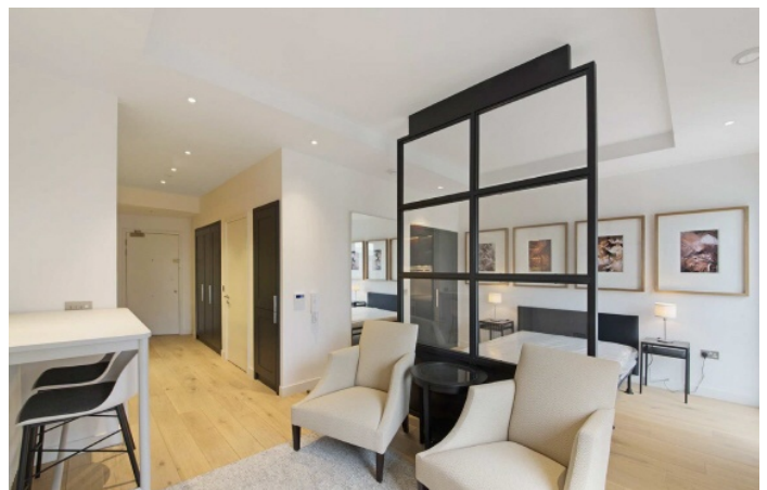
Botanic Square, E14