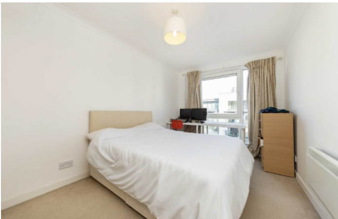
Boardwalk Place, E14