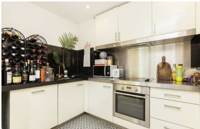
Fairmont Avenue, E14