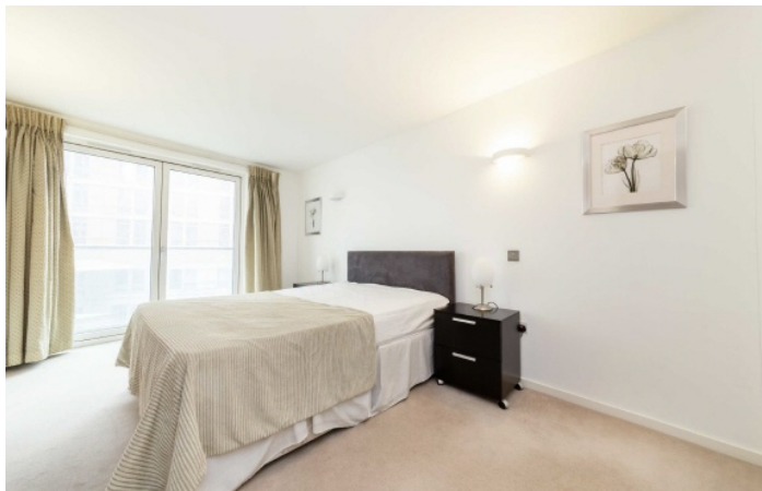
Fairmont Avenue, E14