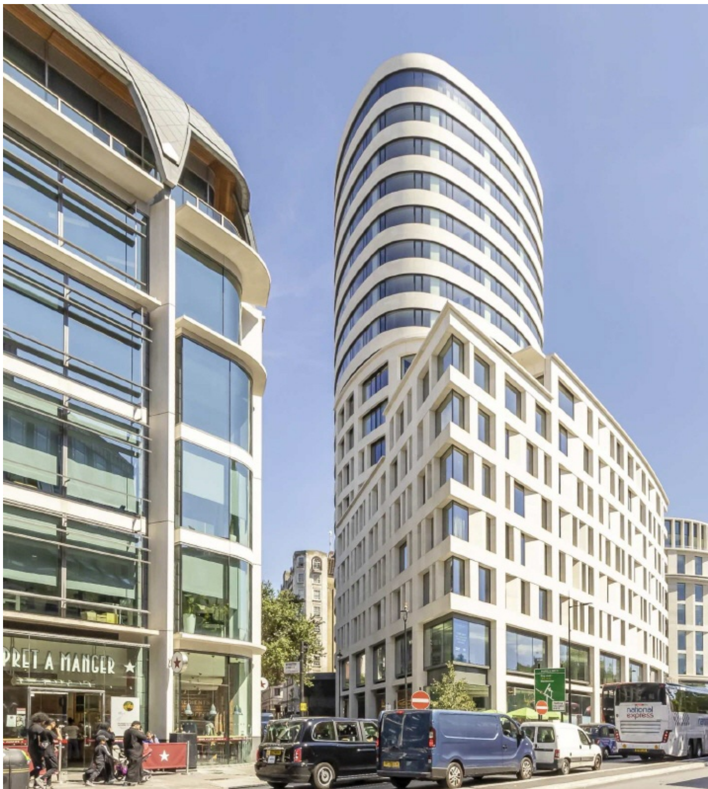
The Bryanston, W1H £5,600,000