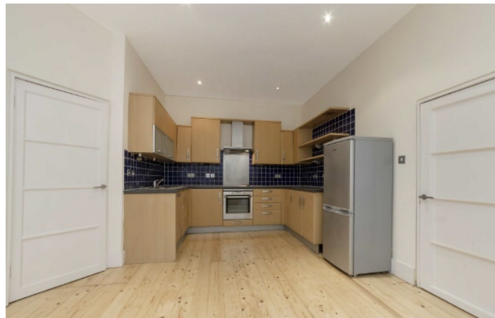
Holland Park Mews, W11