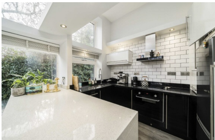
Arundel Gardens, W11