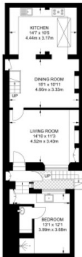
LOWER GROUND FLOOR 686 SQ FT / 63.7 SQ M