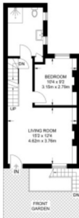
RAISED GROUND FLOOR 436 SQ FT / 40.5 SQ M