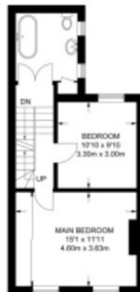
FIRST FLOOR 435 SQ FT / 40.4 SQ M

APPROXIMATE GROSS INTERNAL AREA 1597 SQ FT / 148.3 SQ M