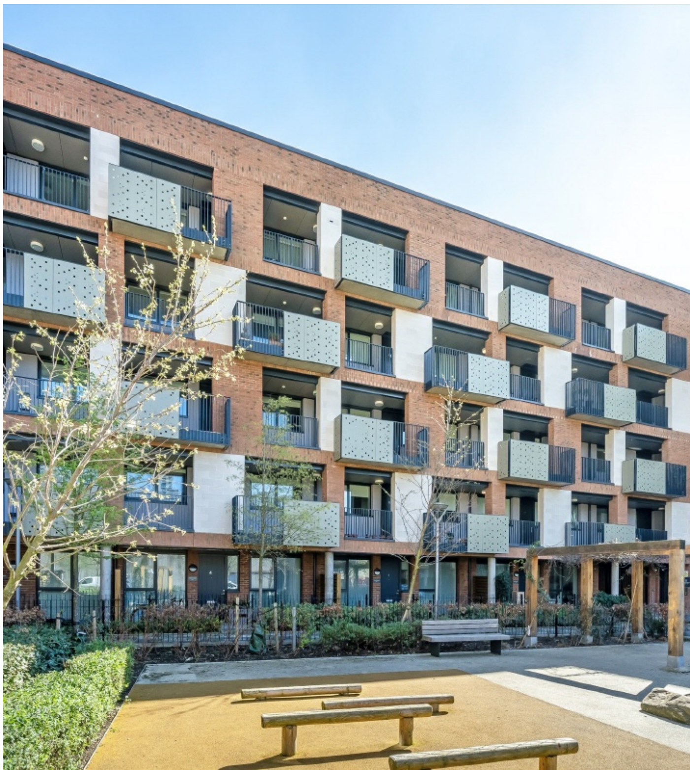
Danson Mews, SE17 £675,000