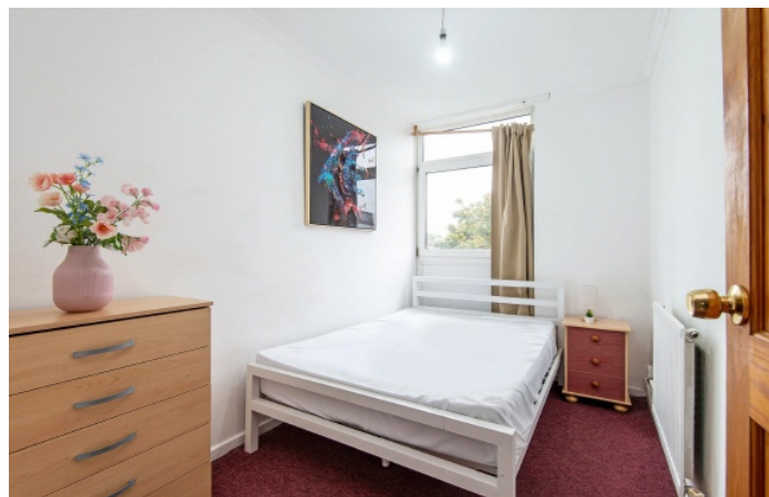
Tomlinson Close, E2