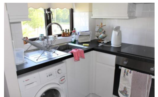
Winningales Court, Vienna Close Clayhall IG5