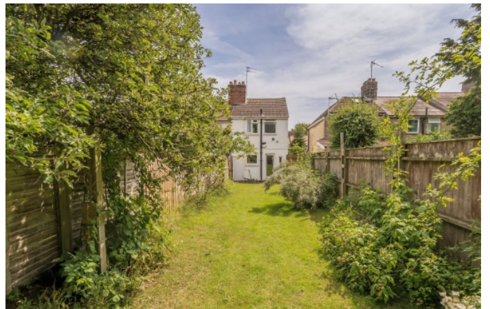
Hill Road, N10