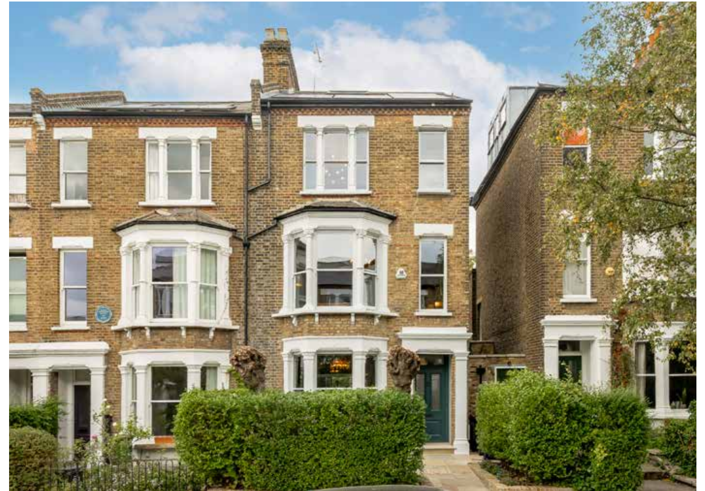
Lady Somerset Road Kentish Town