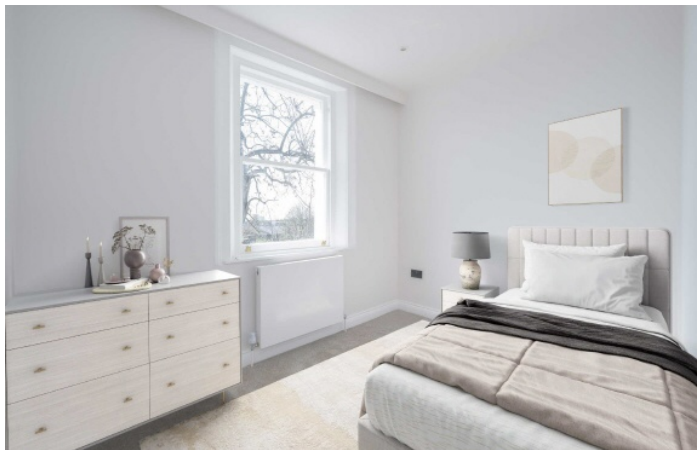
Abbey Road, NW6