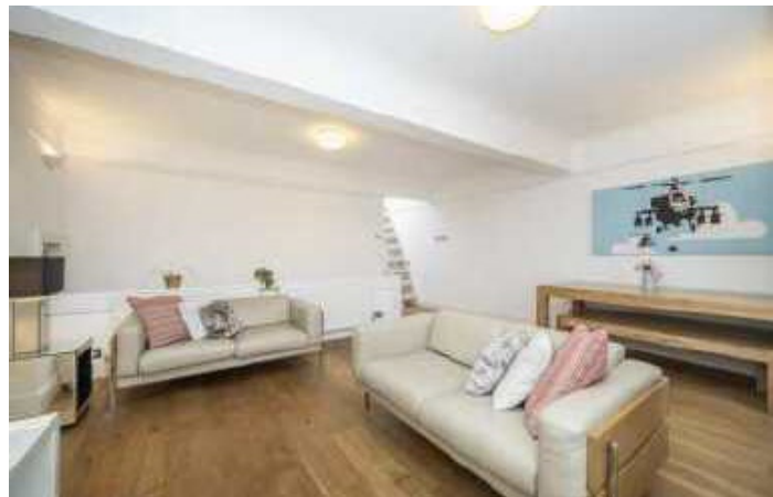
West End Lane, NW6