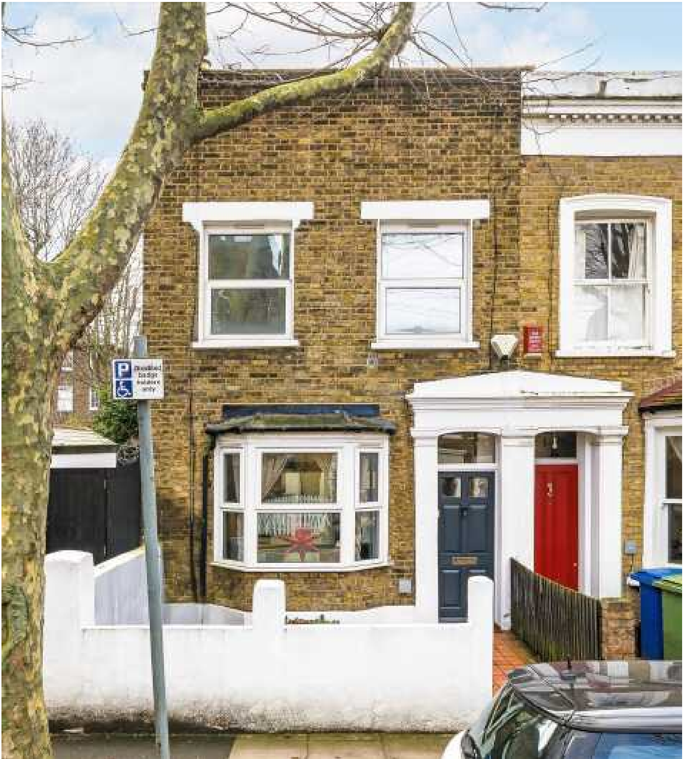
Chadwick Road, SE15 £1,200,000